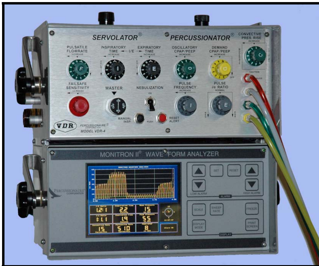
THE INTUITIVE VDR®-4 MODEL F00008-1 WITH ACCESSORY MONITRON® II MODEL F00007-1

ASK THE EXPERIENCED VDR® MILITARY OR CIVIL CLINICIAN